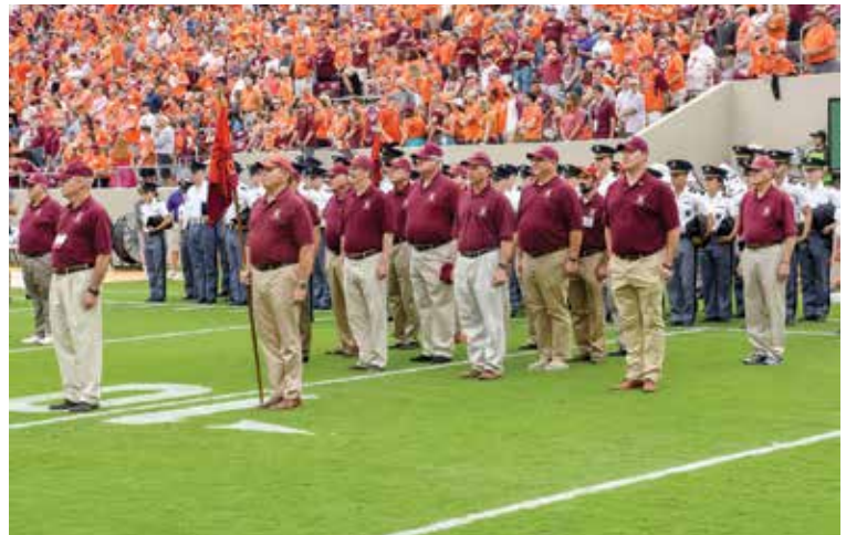
On the field, alumni line up by company alongside today's cadets.