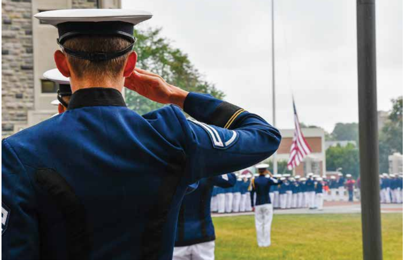
Cadets salute as the flag is lowered during a formal retreat ceremony.