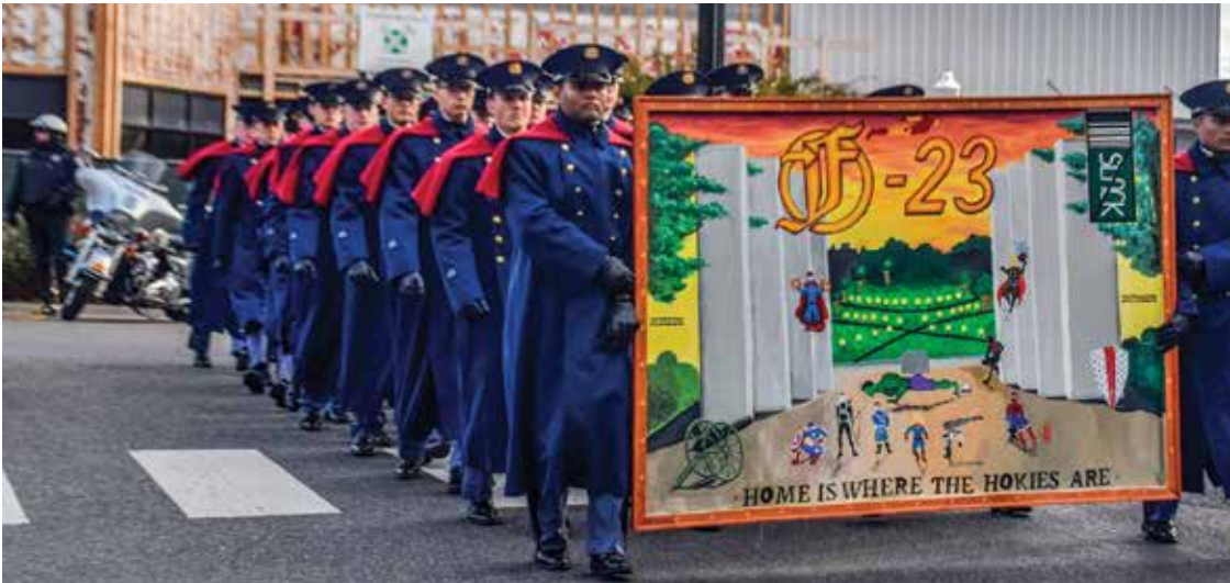
Foxtrot Company not only won the Corps of Cadets' homecoming banner competition, the company took second place overall in the parade's walker/banner category.