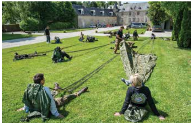
The team packs parachutes on the lawn of the chateau.