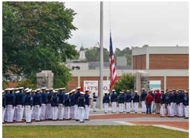
After the flag is lowered, cadets stand at order arms.