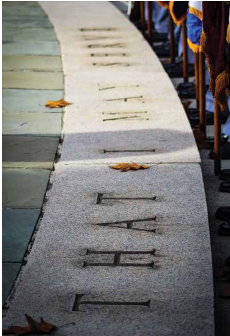
Five names were added to the Honor Pylon. The sixth was added to the Ut Prosim Pylon.