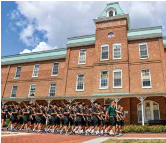
New cadets practiced marching along the sidewalks of Upper Quad during New Cadet Week.