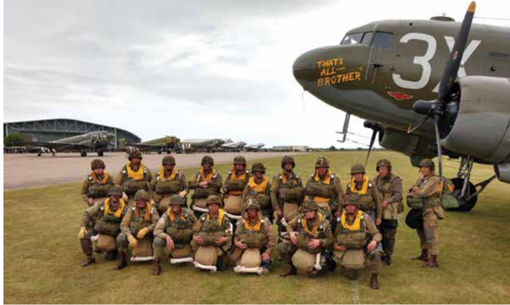
The group is rigged and ready to board at the Royal Air Force Duxford Airfield, England.

Wednesday, June 5, came early as we arrived at the airfield to prepare for the cross-channel flight and execute the airborne commemoration. The drop zone (DZ) was to be DZ “Kilo,” the British 6th Division’s historic DZ on the outskirts of Sannerville, France. The viewing areas were roped, the crowds were assembled, and all preparations were made. My wife, my daughter and her family had traveled to France specifically for this event and were among the throng of spectators at the edges of DZ “Kilo.”