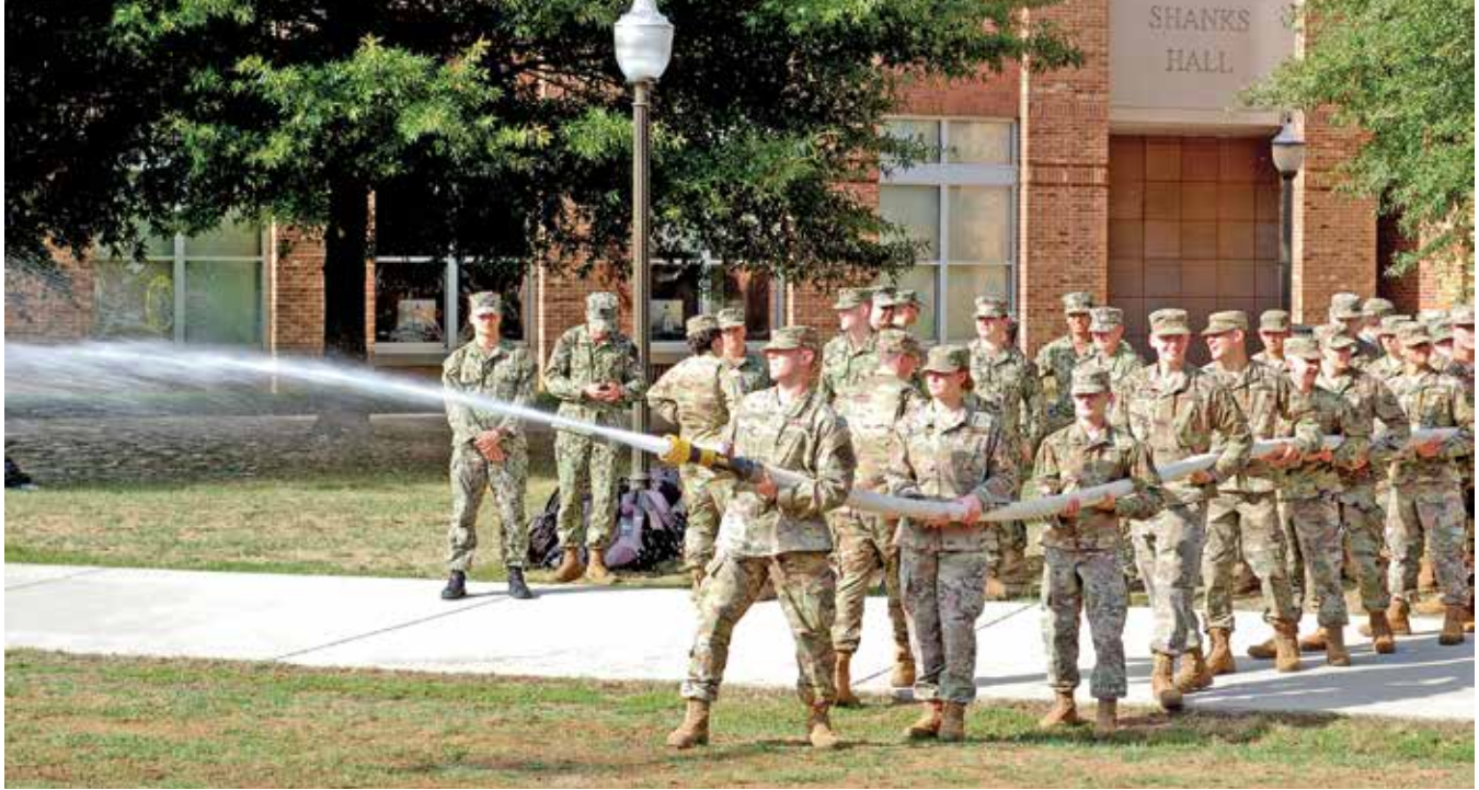
Midshipmen fourth class from Delta Company practice proper hose technique with Blacksburg firefighters during a damage control lab.