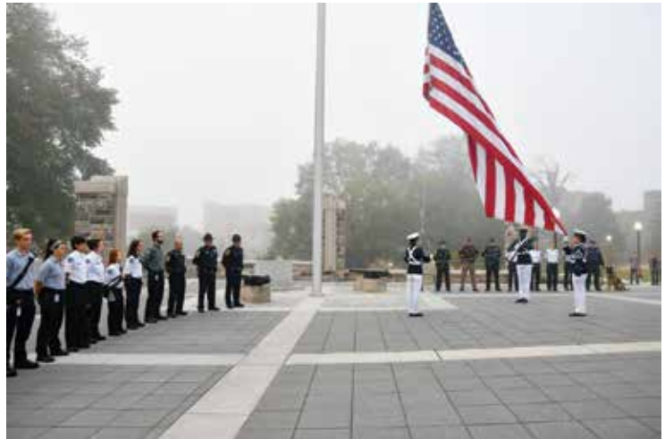
The regiment marked the anniversary of the 9/11 terrorist attacks and said thank to you local first responders on Sept. 11.