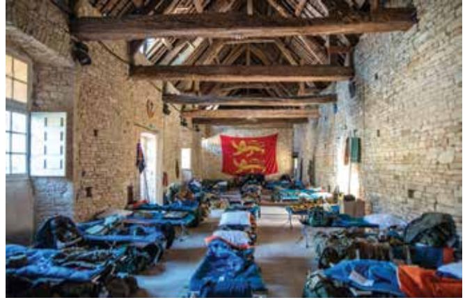
The team's living quarters in the west wing of the Chateau.