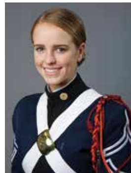
Air Force Wing Commander Sydney Tinker National Security and Foreign Affairs Air Force