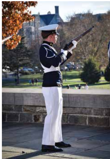
The Gregory Guard fires a rifle salute at the end of the ceremony.

In November 2018, the Virginia Tech Board of Visitors passed a resolution to create a policy on adding names to the war memorial. The action formalized the long-standing tradition held by the Corps of Cadets as the guardians of the Pylons. To be added, a person must: