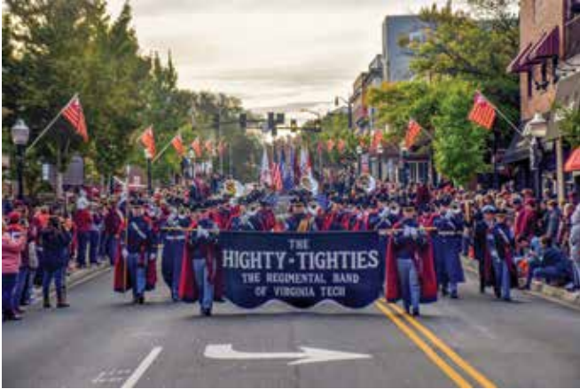
The Highty-Tighties march with precision through downtown Blacksburg during the homecoming parade.