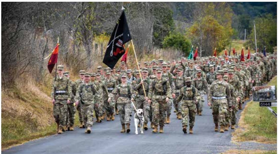
First-year cadets and their training cadre made the 13-mile Fall Caldwell March on Oct. 5.