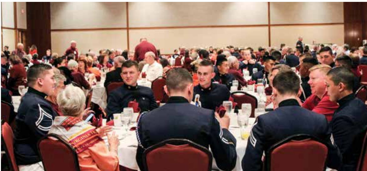
Cadets enjoy breakfast with their scholarship donors.