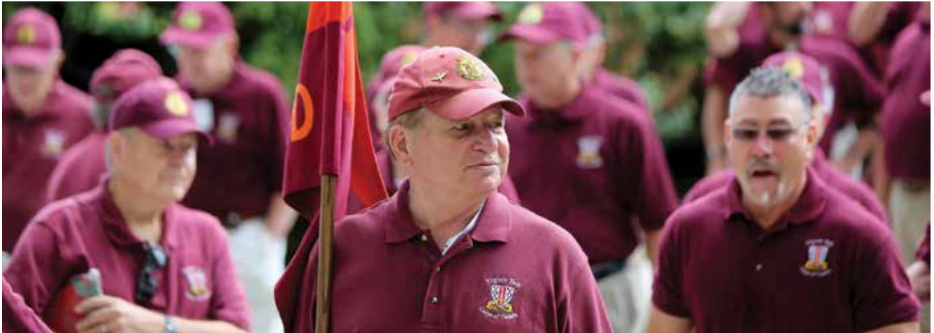
Alumni work on their guidon skills outside Lane Stadium.