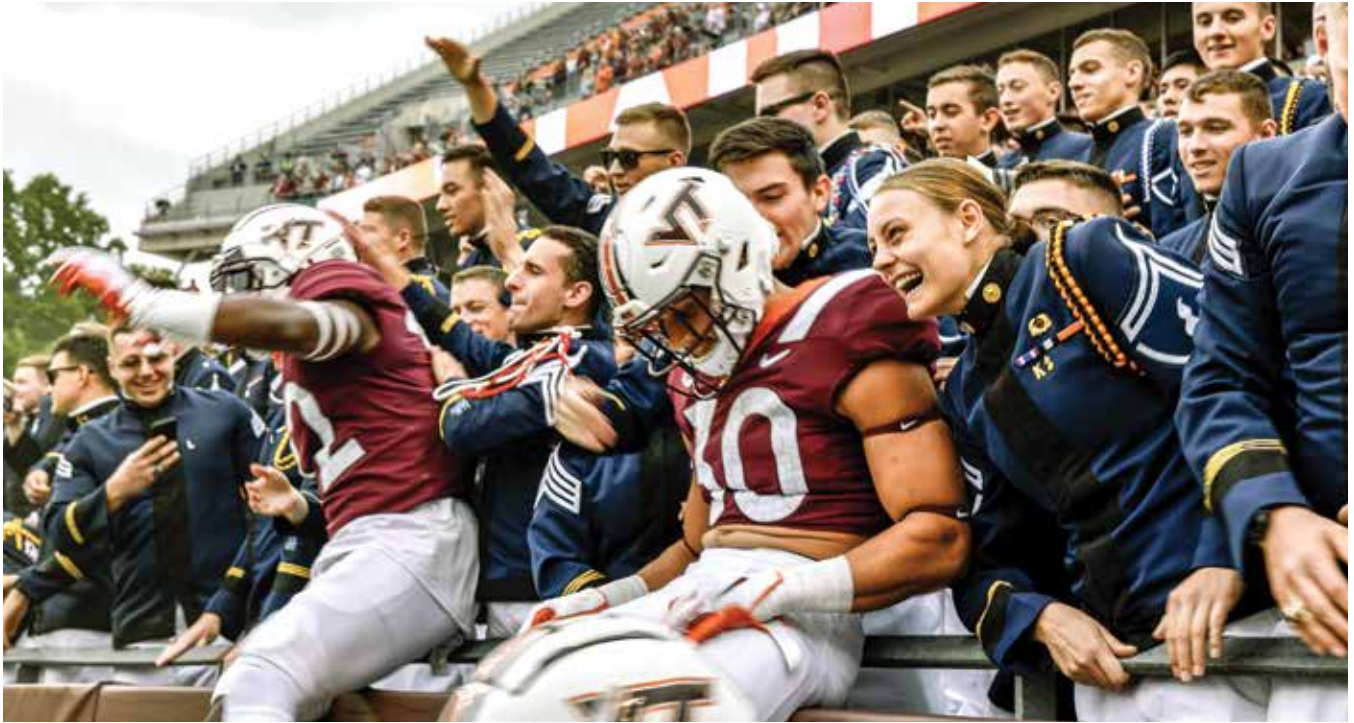
Hokie football players jump into the cadet sections in the South End Zone at the start of the Duke game.