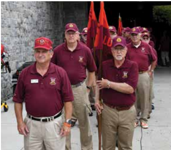
Alumni line up at the southeast tunnel into Lane Stadium to await their entrance onto the field.