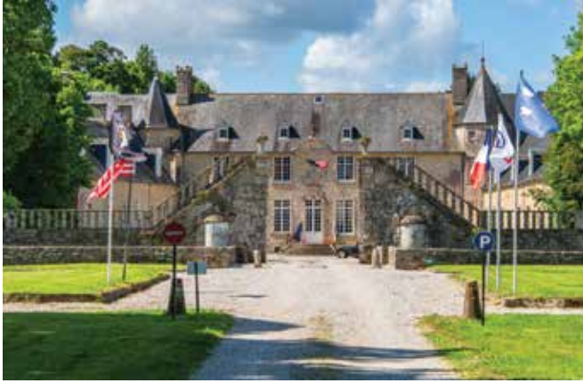
In France, the team stayed at the Chateau de Plain Marais, located in Beuzeville de Bastille near Sainte Mère Eglise.