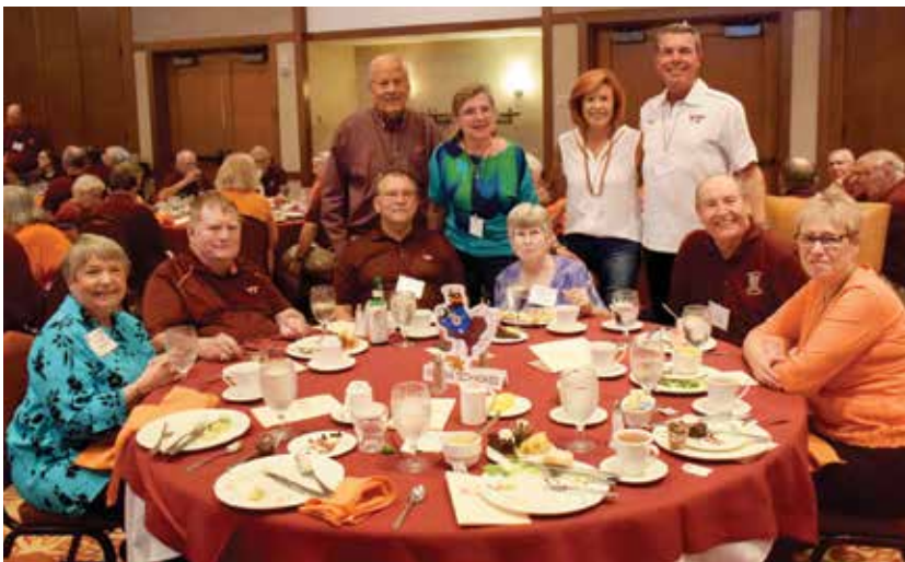
The reunion dinners provide alumni with an opportunity to catch up.