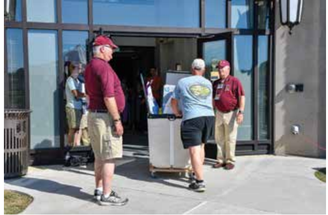
Alumni volunteers helped the parents of new cadets during New Cadet Week Move In on Aug. 17.

AS THE REGIMENT CONTINUES TO GROW — 1,154 CADETS THIS FALL — SO DOES THE EXCITEMENT SURROUNDING OUR EVENTS.