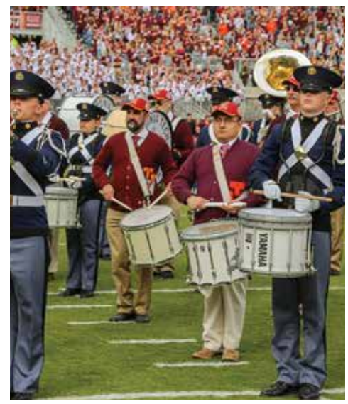
During the homecoming game, the Highty-Tighties perform alongside the alumni.