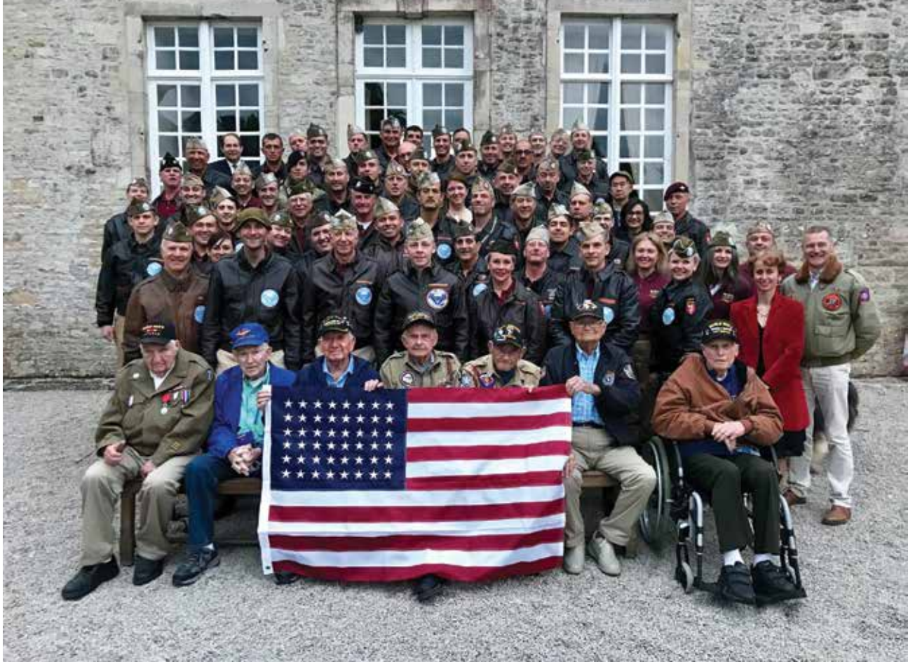
The reason the WWII Airborne Demonstration Team exists: to remember, honor, and serve America's war veterans. The front row is a group of American veterans of World War II, who made the trip to France to celebrate with the ADT.

All members of the ADT who were jumping into Normandy carried on their person (and perhaps next to their heart) a trove of meaningful items representing World War II warriors specifically important to that jumper. They included dogtags from family friends, rank insignia from a beloved family member, and photos of special veterans