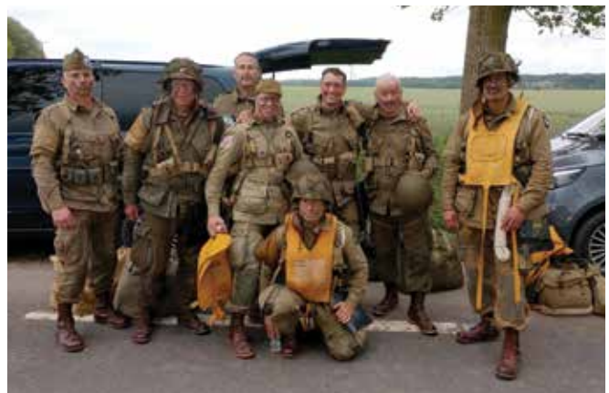
Team members link up after the jump onto DZ “Kilo” in Sannerville, France.