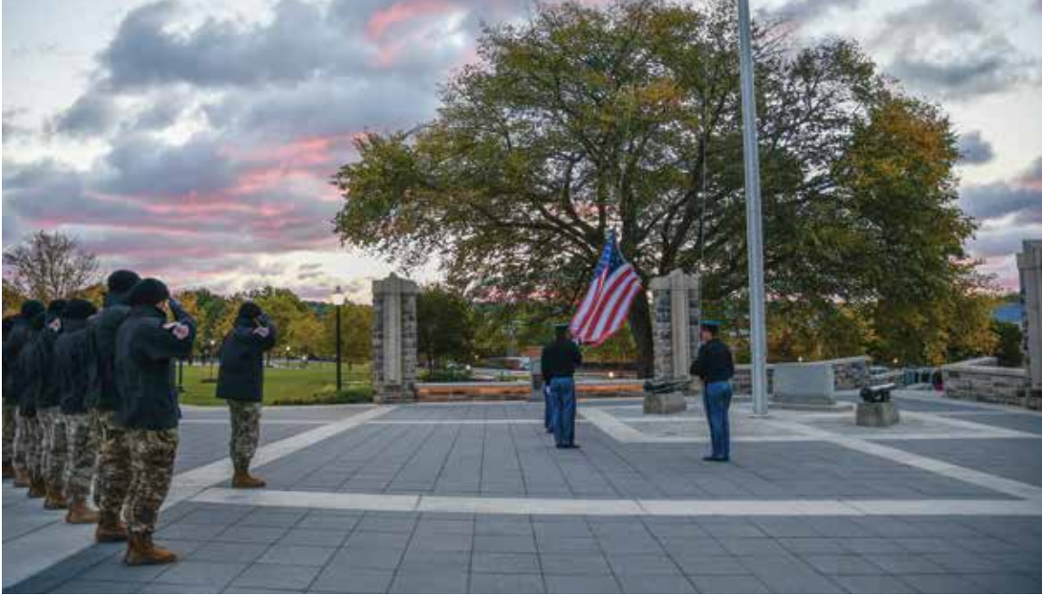
Regimental staff lead cadets in saluting the flag on a cold November morning.

ity to assess its effectiveness. Through additional staffing, the Rice Center will have the resources to expand its connections to Virginia Tech's colleges and programs and create new collaborative relationships. These partnerships will maximize the opportunities offered by Virginia Tech's research prowess.