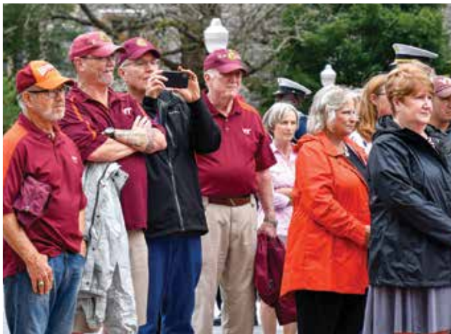
Returning alumni gather for the Friday afternoon formal retreat ceremony on Upper Quad.