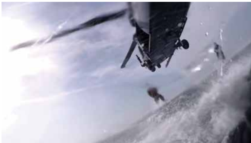
Braich surfaces as two more cadets exit the helicopter.