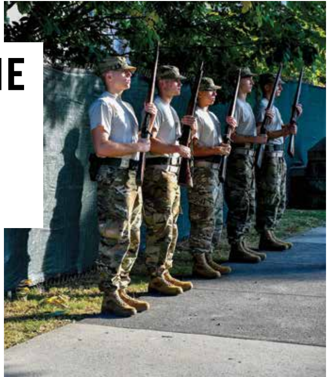
New cadets practice their rifle drill during this year's New Cadet Week training.