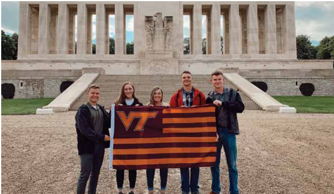
Cadets raise a Virginia Tech flag in front of the World War I Chateau-Thierry American Monument in France during their Global Scholars trip to study the decisive battles of World War I.

The Major General W. Thomas Rice Center for Leader Development is a key driver in the Corps' effort to equip cadets with leadership theory and allow them to research an array of leadership styles. Between now and 2027, private support will dramatically enhance the center's programming and its abil-