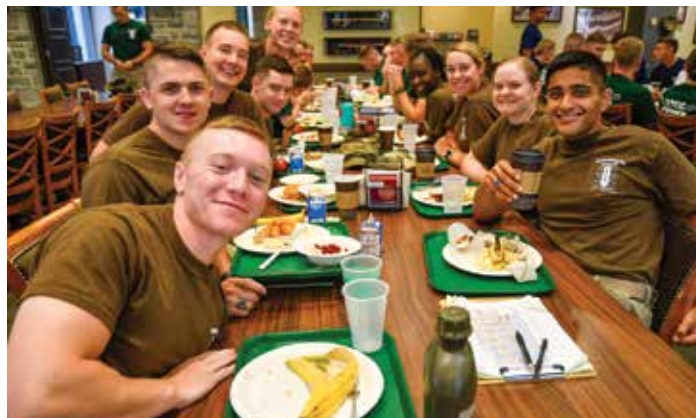
Members of the fall’s regimental staff gather over breakfast during New Cadet Week.

He’s stayed deeply involved, and is a member of the executive committee of the Corps’ alumni board.